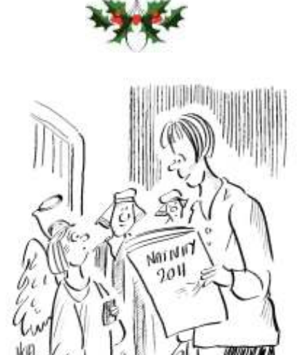
"Nice idea, Amelia, but I don't think the Angel of the Lord texting the shepherds would have the same dramatic effect."