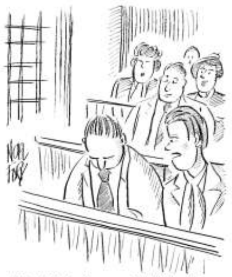
"You'll be in deep trouble if the vicar finds out you're not deeply meditating, just playing with your new iPad!"