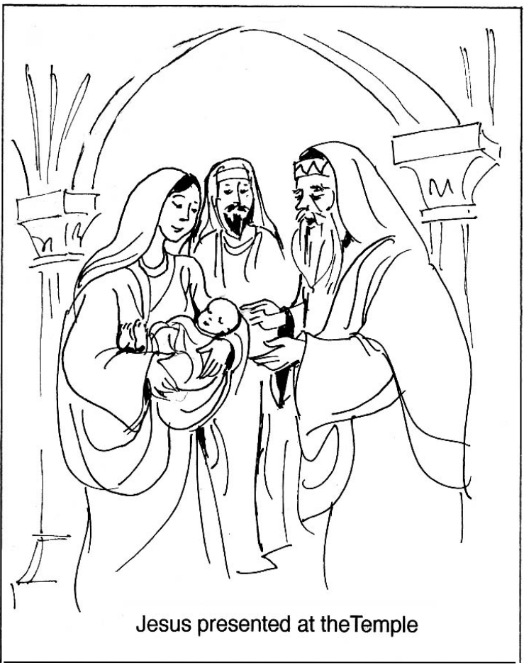
Jesus presented at the Temple