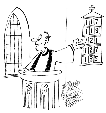
Today's hymns are based on last week's trend in petrol prices...

Sometimes your joy is the source of your smile, but sometimes your smile can be the source of your joy. Thich Nhat Hanh